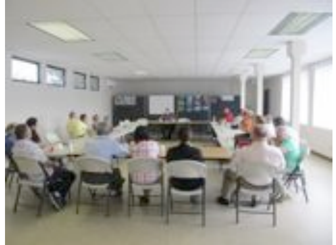
An IFCB conference discussion session

We praise God for the privilege of working in missionary evangelism in these last days.