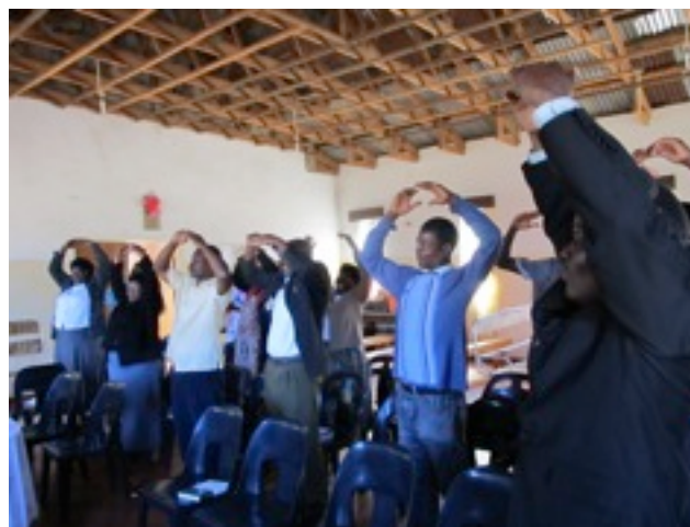
Some of the group from Gwanda doing stretches as the session was quite long.

lovely meeting with people hungry for God's Word. When I asked them how many concordances would they need for the students there, the answer was 24! I gulped. I had just priced one here and it was $86 at the only place that offers them. I know in the States they are available for about $10 and then the shipping costs to get them here.